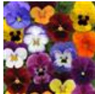
Autumn Select Mixture