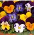
Jump Up Mixture