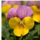
Yellow Pink Jump Up